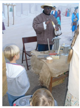
This re-enactor worked at Colonial Williamsburg as a teenager!