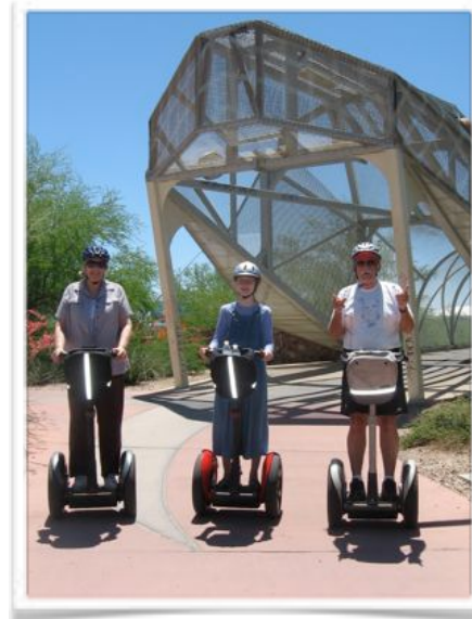
Rattlesnake Bridge near downtown Tucson