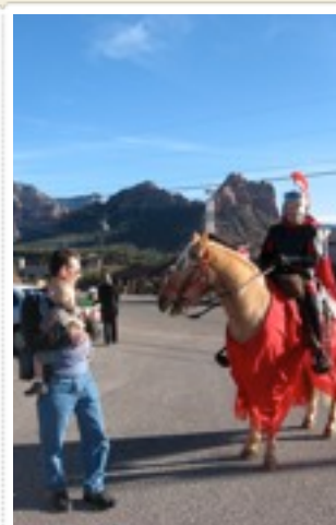
A Roman soldier on a horse