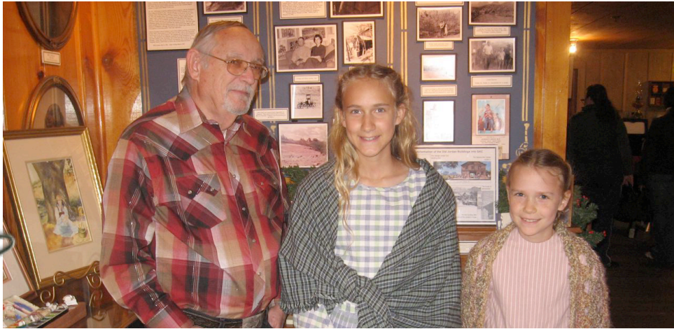
The girls met a descendant of the Jordan family who actually lived in this cabin that houses the Museum