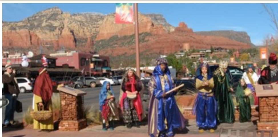
The three Brightly dressed travelers

If, however, you happened to stop by the Bethlehem Inn and peek inside the stable near the entrance, you might believe the shepherds. For there lays a child in the manger, wrapped in swaddling clothes, just as the shepherds and the angel said.