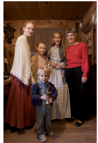
Granddaughter of Sedona Schnebly