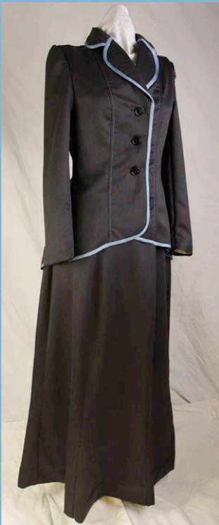
The suit, displayed on my dress form

I'm entering this suit in the ASG Creativity Contest (winners announced in June), as well as the "Make It Yourself With Wool" contest, which takes place this fall.